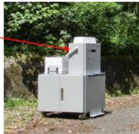
Portable monitoring post

(Ambient dose rate) · NaI scintillation detector · Semiconductor detector